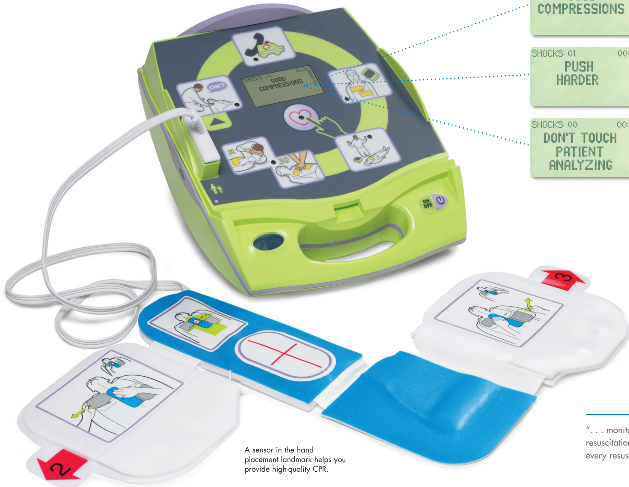
A sensor in the hand placement landmark helps you provide high-quality CPR.